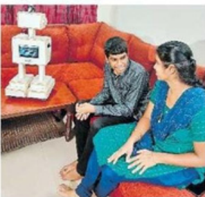
ಕನ ಕಲ್ಲಿ ಗ್ರಾಹಿತಿ ವಿವರಿಸ್ತು.